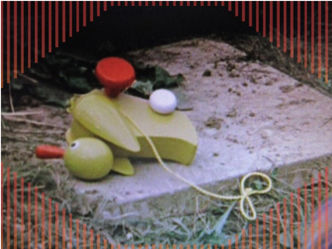
"Wooden Duck on Wheels. Yellow Job" (Straight & Steady Minicabs)